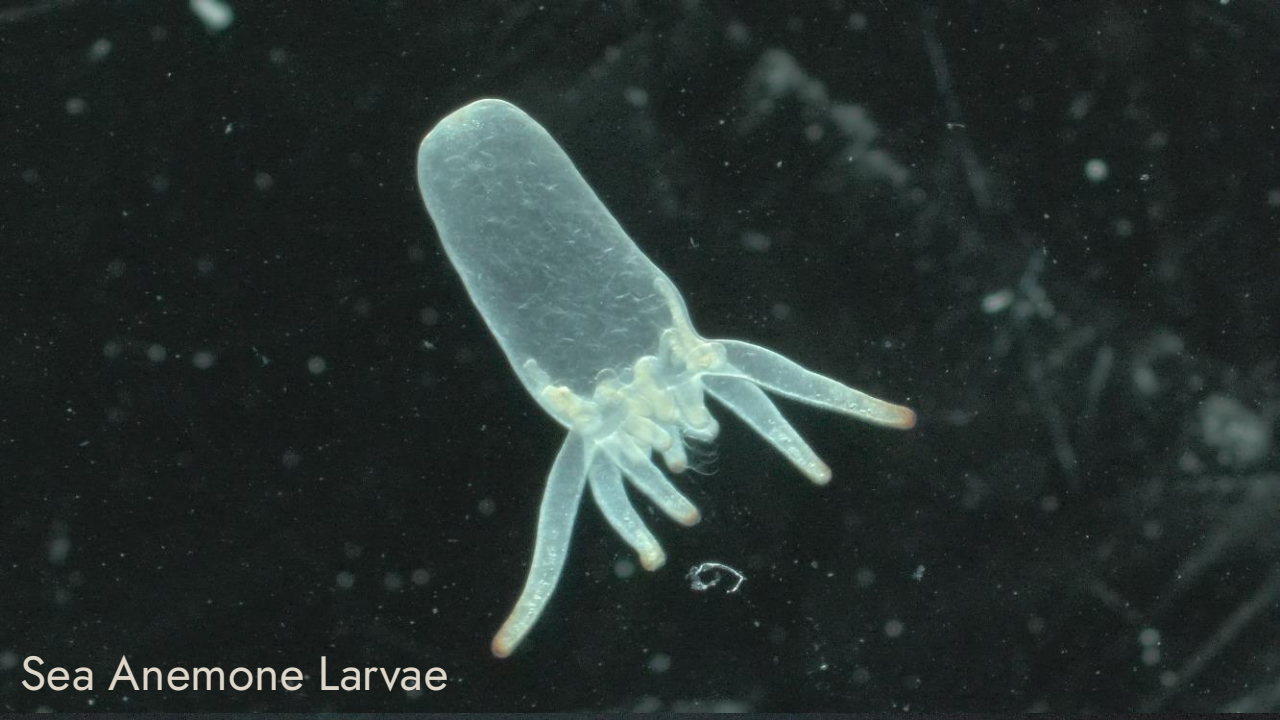
Sea Anemone Larvae