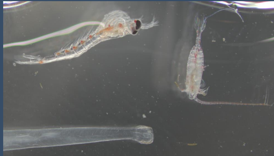
Krill, Calanus copepod and a worm Chaethognath