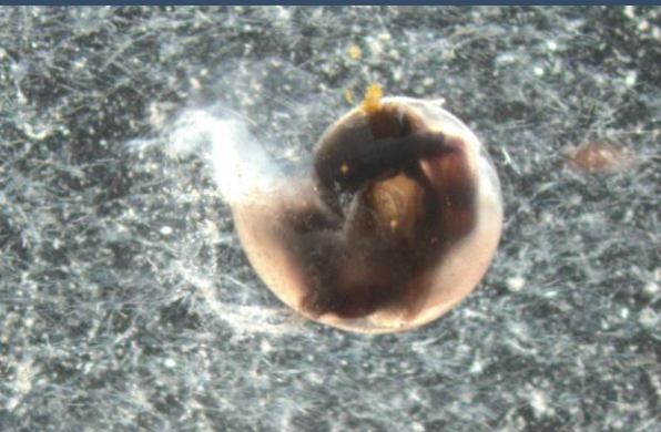
Sea butterfly, Limacina helicina