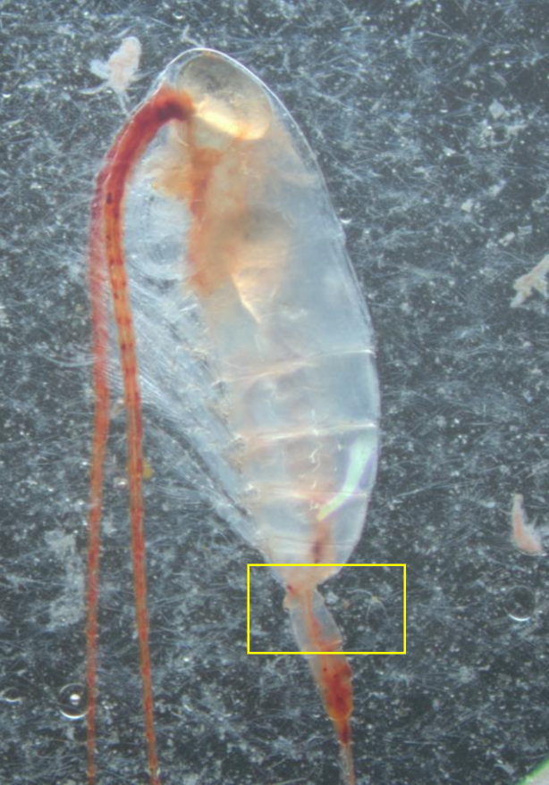
Arctic copepods Calanus hyperboreus ,

In most of our samples we found a lot of copepods, also called “energy bars” of the Arctic because they are very rich in lipids. We also observed Chaetoceros (phytoplankton) especially in a sample in Greenland as well as krill, sea butterflies, worms, jellyfish and comb jelly.