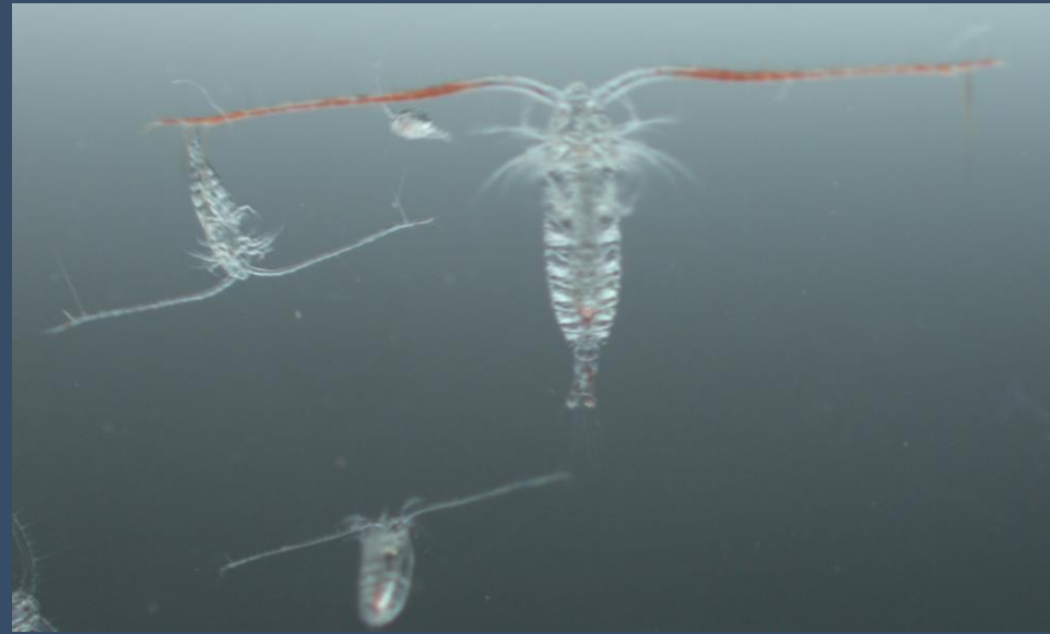
Calanus sp. Copepods