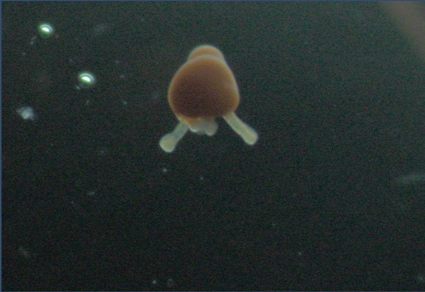
First stage of sea cucumber.