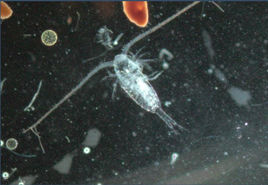
Copepod (a crustacean) together with two diatoms (the green spheres).