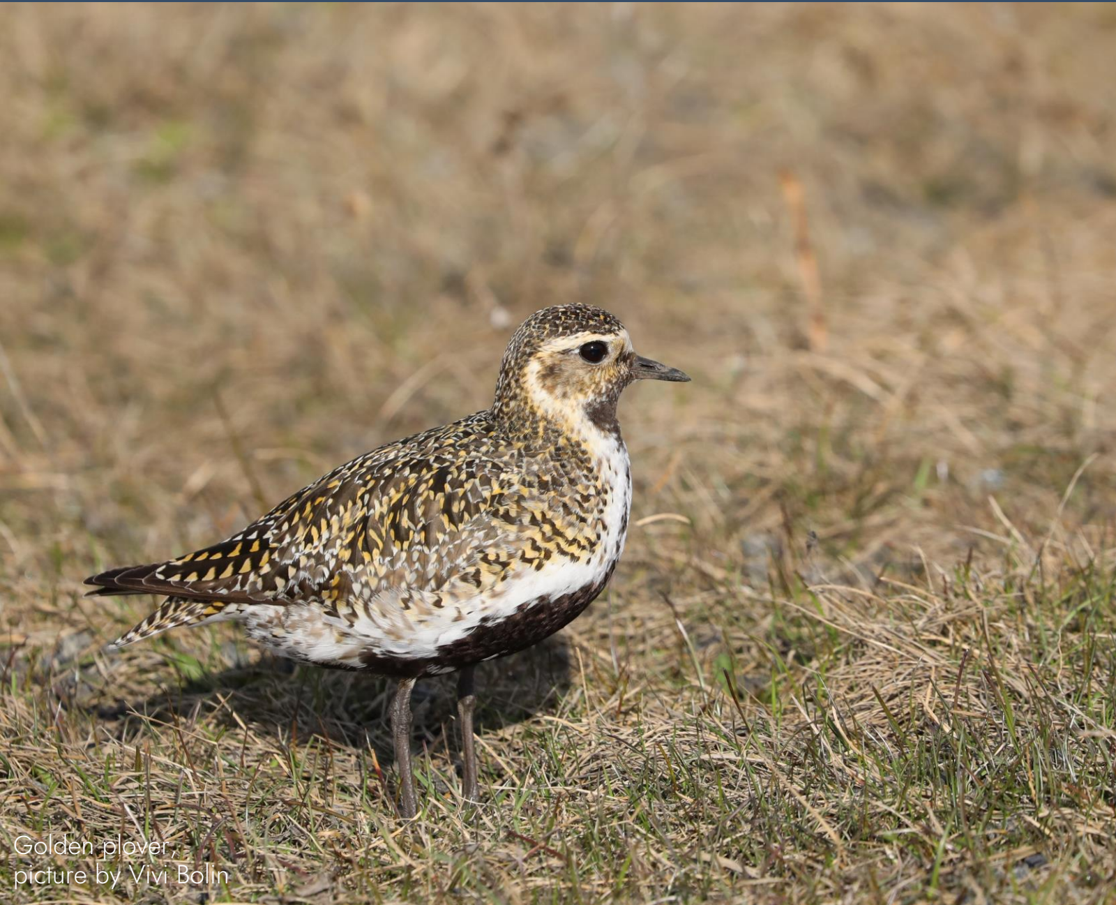
Golden plover