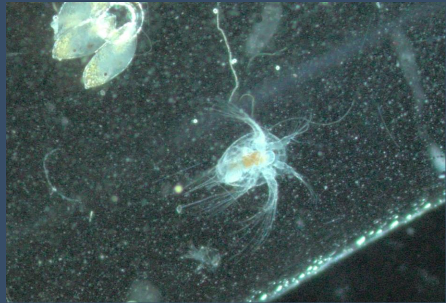
Two stages of barnacle larvae – a nauplius (the first stage) and three cypris (the second stage, upper left corner).