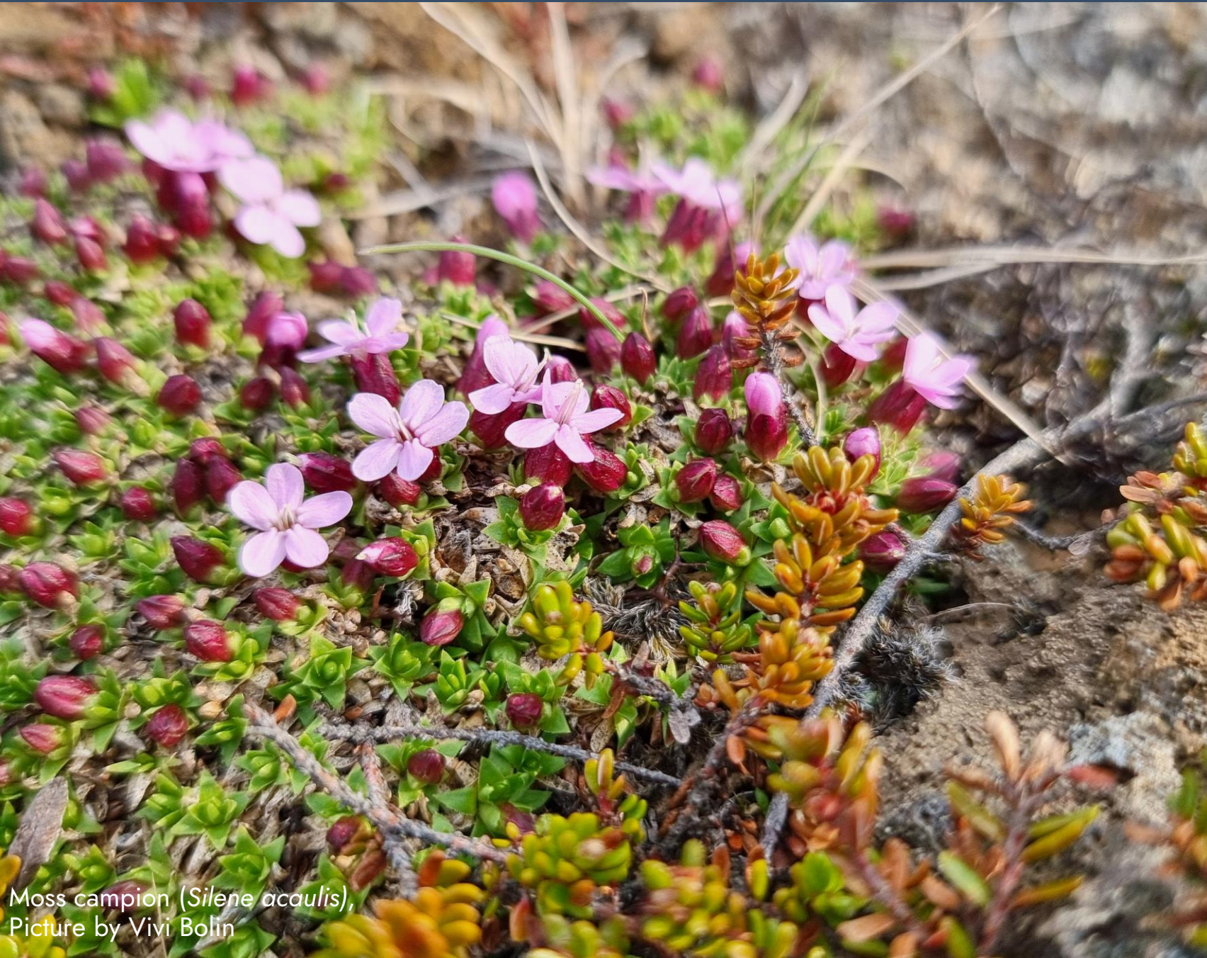
Moss campion ( Silene acaulis )